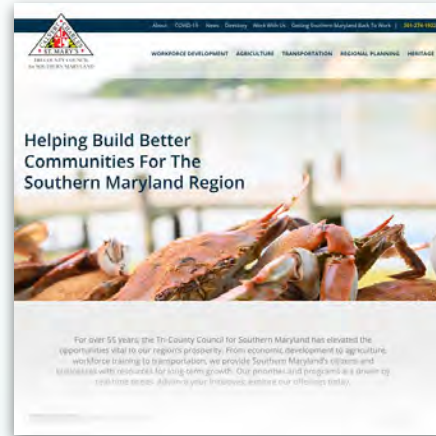
Tri-County Council for Southern Maryland